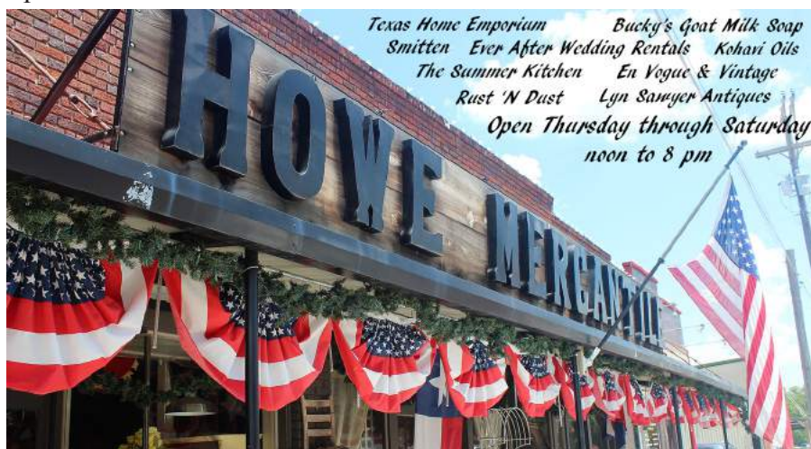
Coming Soon Hidden Creek Pavilion.