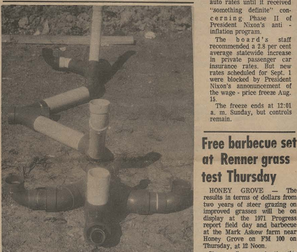
This is what it appears to be, if you're familiar with this type thing. It's a bunch of assembled plumbing for one of the apartment buildings under construction in Western Hills. Fourteen buildings to house 100 units is currently under construction with completion set about September, 1972