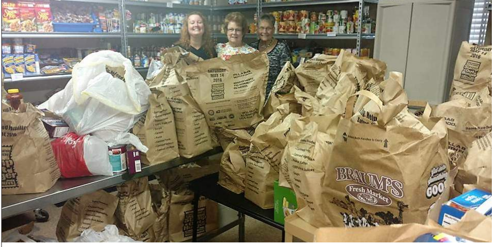
Delivered to Feed My Sheep

The need for food donations is great. Currently, 49 million Americans—1 in 6—are unsure where their next meal is coming who feel hunger's impact on their overall health and ability to perform in school. And over 5 million seniors over age 60 are food insecure, with many who live on fixed incomes often too embarrassed to ask for help.