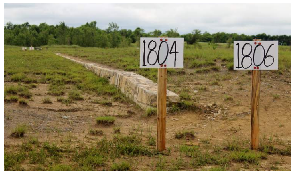
Lots are sectioned off and dirt ready for first few homes

The Summit Hill master-planned-development now consists of approximately 350 acres with almost a mile of frontage along U.S. 75 (Central Expressway). Cothran Malibu chose LGI to develop the existing single family lots due to their high degree of success of building quality housing in this market sector. The second phase of the Summit Hill single family development consists of approximately 78 acres with approximately 340 lots, which when added to the 113 existing lots would bring the total lot count to over 450 homes.