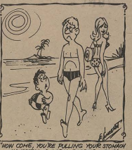
Now come, you're pulling your stony in when a lady passes you!