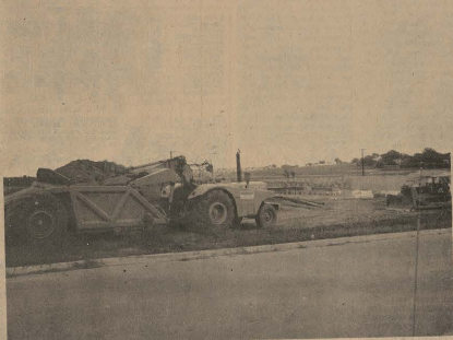
GROUNDWORK for a new 100-unit apartment complex was started within the past week, when heavy machinery was moved in to level the area just west of the expressway. The complex will be housed in 14 buildings, with completion date set in nine months. New White A to store building is in background.