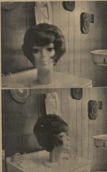
MISS MOODY /Hecklon Fiber Regular $29.95 . . . . . Sale Price $15.00