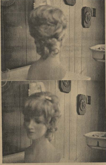
LONDON SHAG /Hecklon Fiber Regular $29.95 . . . . . Sale Price $15.00

COME IN AND REGISTER FOR FREE WIG TO BE GIVEN AWAY SATURDAY, MAY 1st