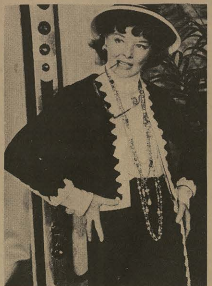
Katherine Hepburn stars in the Broadway production of "Coco", to be presented on tour at the State Fair Music Hall in Dallas, April 20-24.