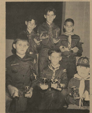
CUB SCOUT PINWOOD DERBY WINNERS

The group expressed appreciation to Lowell Thompson for building the race track for the event.