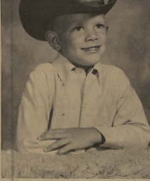
"TODDY" OR "BOBO" SEASONS