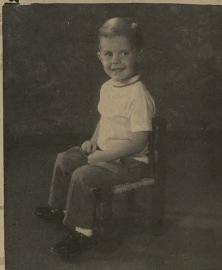
"I'M NOT GUILTY"