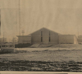
CHURCH OF CHRIST