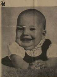
"LOOK, MA, NO CAVITIES"