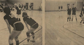
Forward in action in district playoff game Tuesday night.

Only about one-half of one per cent of the graduating seniors in the United States receive the honor.