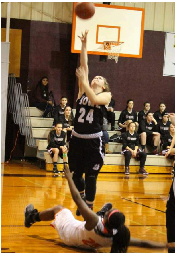
Hawk attack