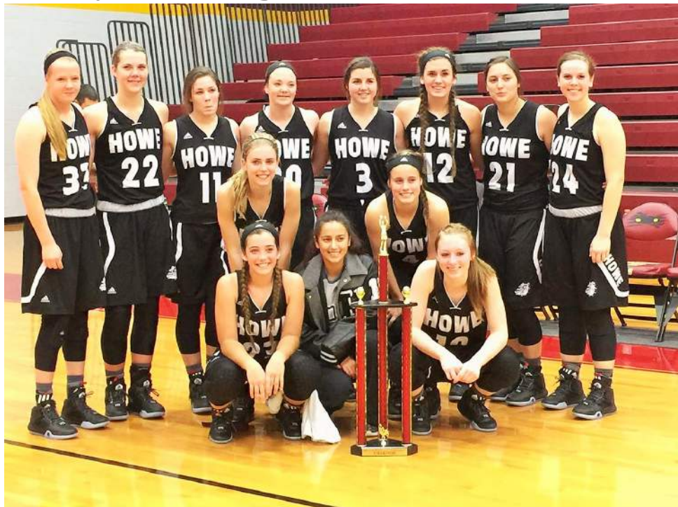
Tournament Champions.