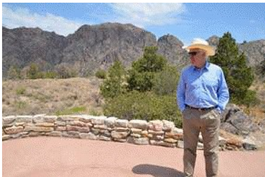
Sen. Cornyn at Big Bend

During the summer, the options are endless for Texans looking for a break from the sweltering heat. TPWD has more than 50 designated paddling trails to make the most of Texas' 200 major lakes, 190,000 miles of rivers, and more than 300 miles of coastland. Many parks offer paddle-boat, canoe, kayak, and lifejacket rentals. At Mustang Island State Park, go kayaking, bird-watching and fishing on the paddling trails that pass through one of the few undeveloped barrier island habitats on the Texas Gulf Coast. Towering sand dunes protect the rich vegetation and wildlife on Mustang Island, including bulrushes, cattails, sedges and over 400 species of birds.