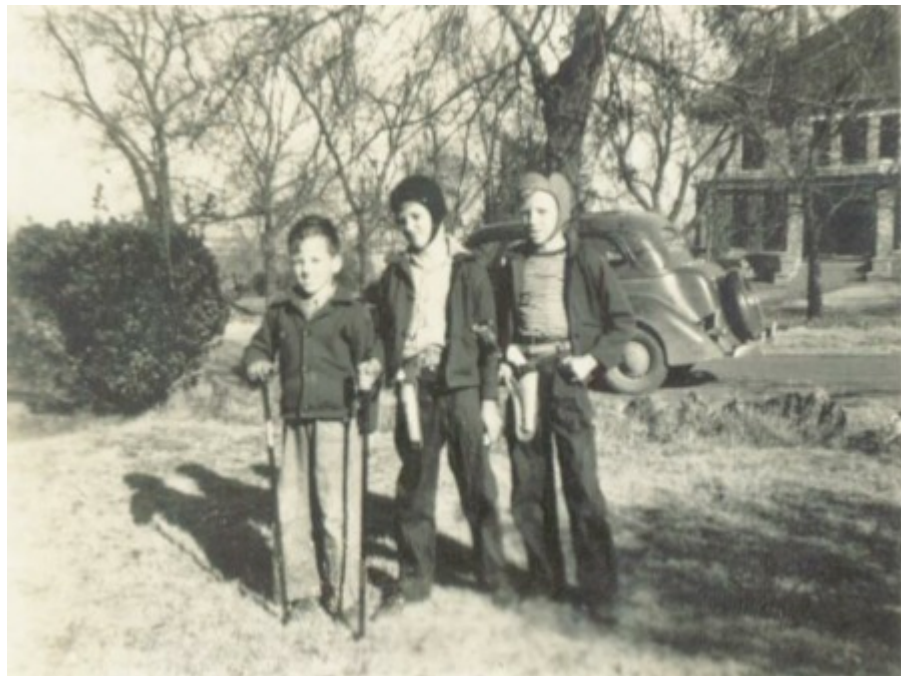
Grayson County Poor Farm story, Saturday

This is an experiment. We have new software that has been giving us trouble. This is the first upload of our pages with it. Hope it works well.