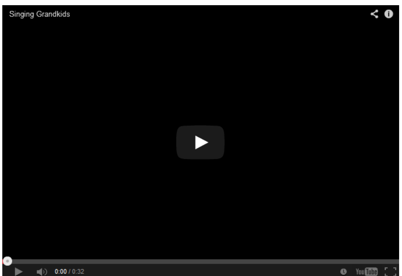
Grandkids singing at the Elves Christmas Tree Farm, 2007