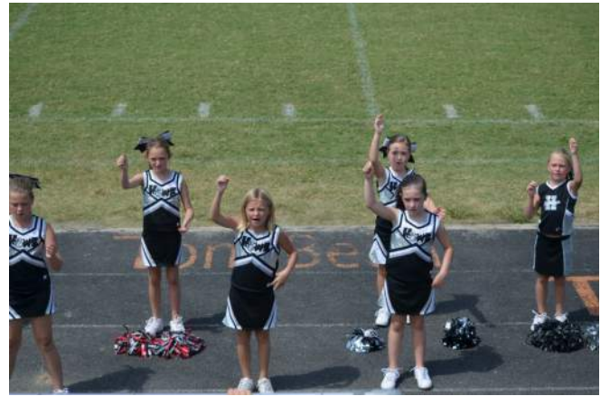
3rd and 4th grade cheerleaders