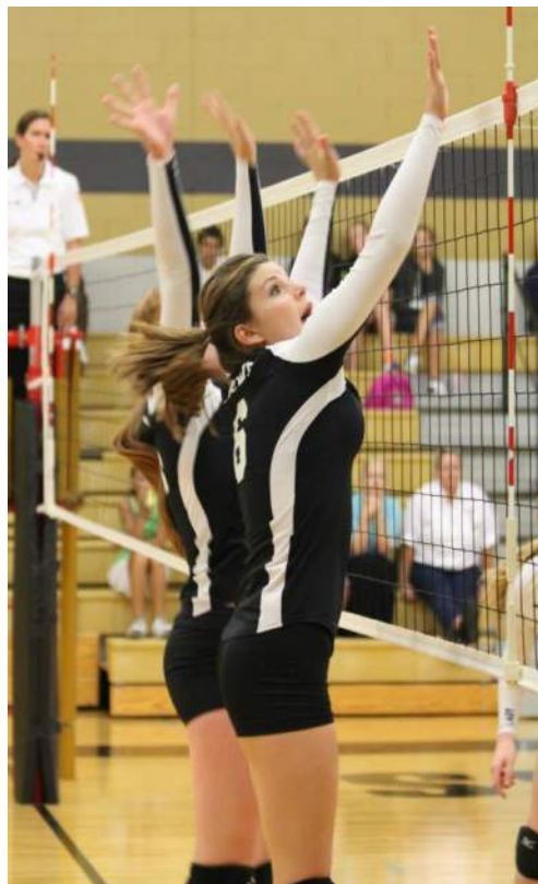
Lady Bulldogs compete at a high level last week

The Howe Lady Bulldogs Volleyball team beat Whitewright Tuesday night. The Howe girls lost the first game, 25-20, but rebounded to win the second, 25-23. Whitewright took the third game, 25-21, but Howe would win the next two 27-25, and 15-10 to capture the come-from-behind match win.