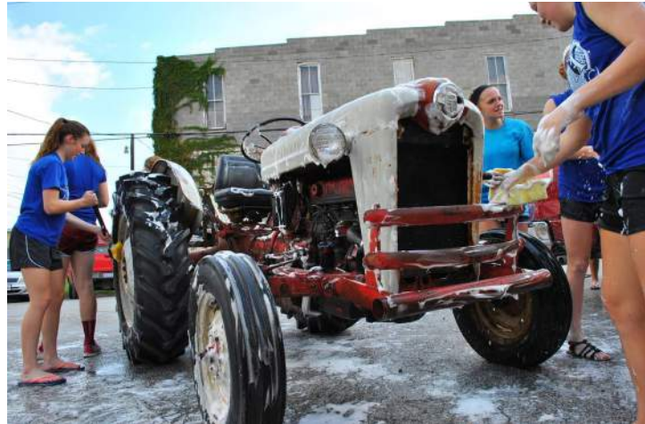
Van Alstyne held a 'you bring it, we clean it' carwash