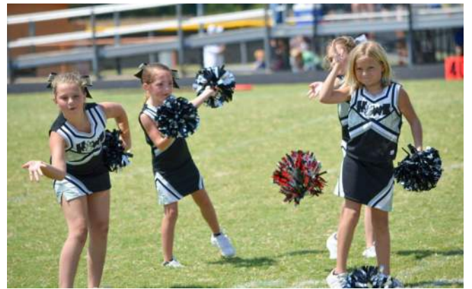
5th and 6th grade cheerleaders