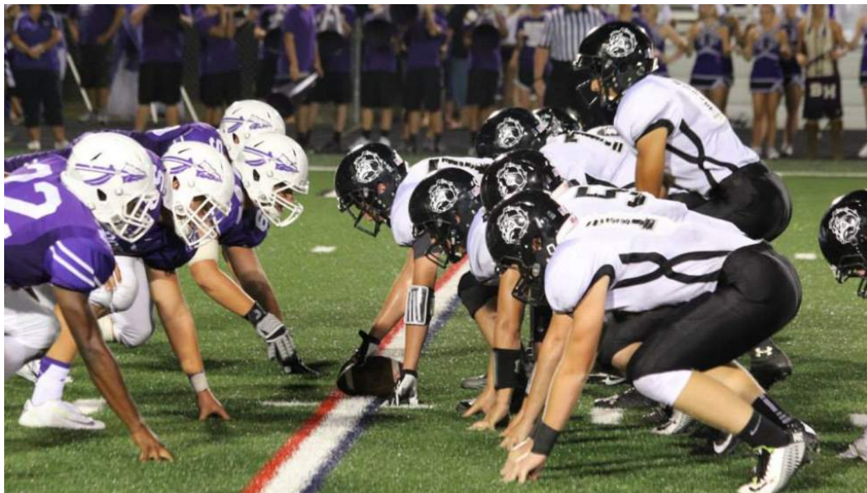
Howe Bulldogs line up in their slot-T formation against Bonham on Friday night.