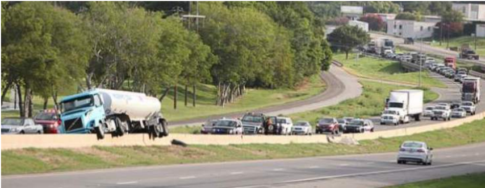
Traffic on US 75