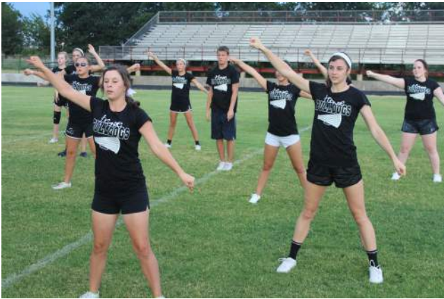
varsity cheerleaders preparing for the upcoming 2014 season.