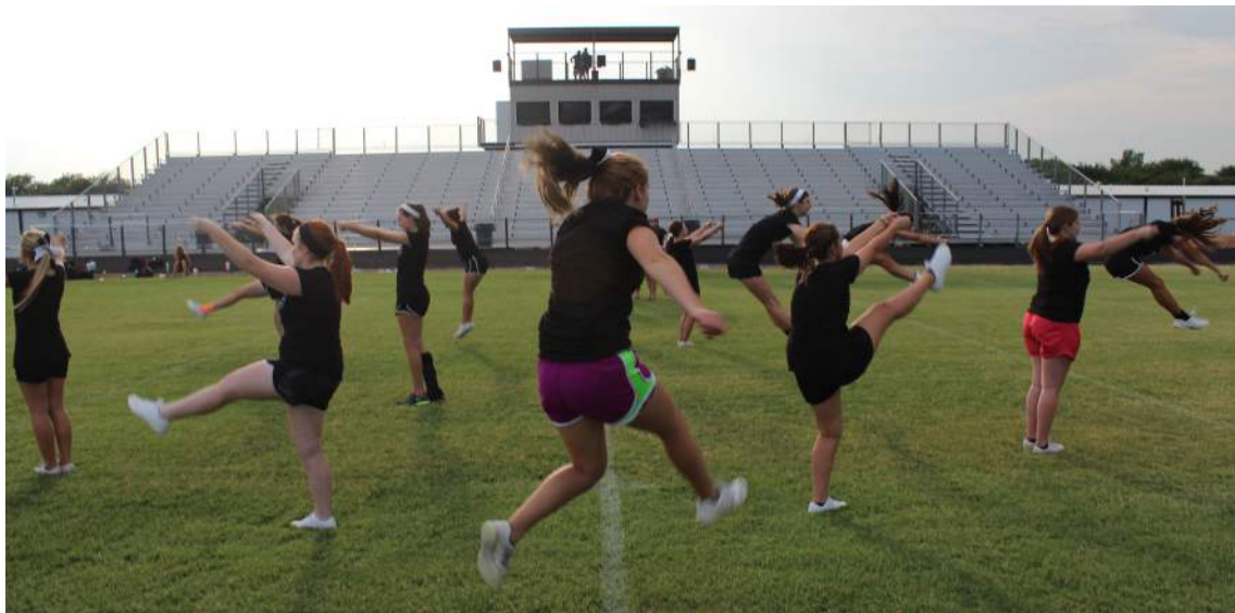
The varsity cheerleaders were learning new routines on Wednesday.