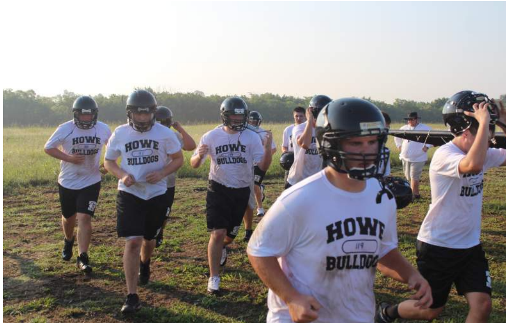
Last Monday officially kicked off the football season with two-a-days