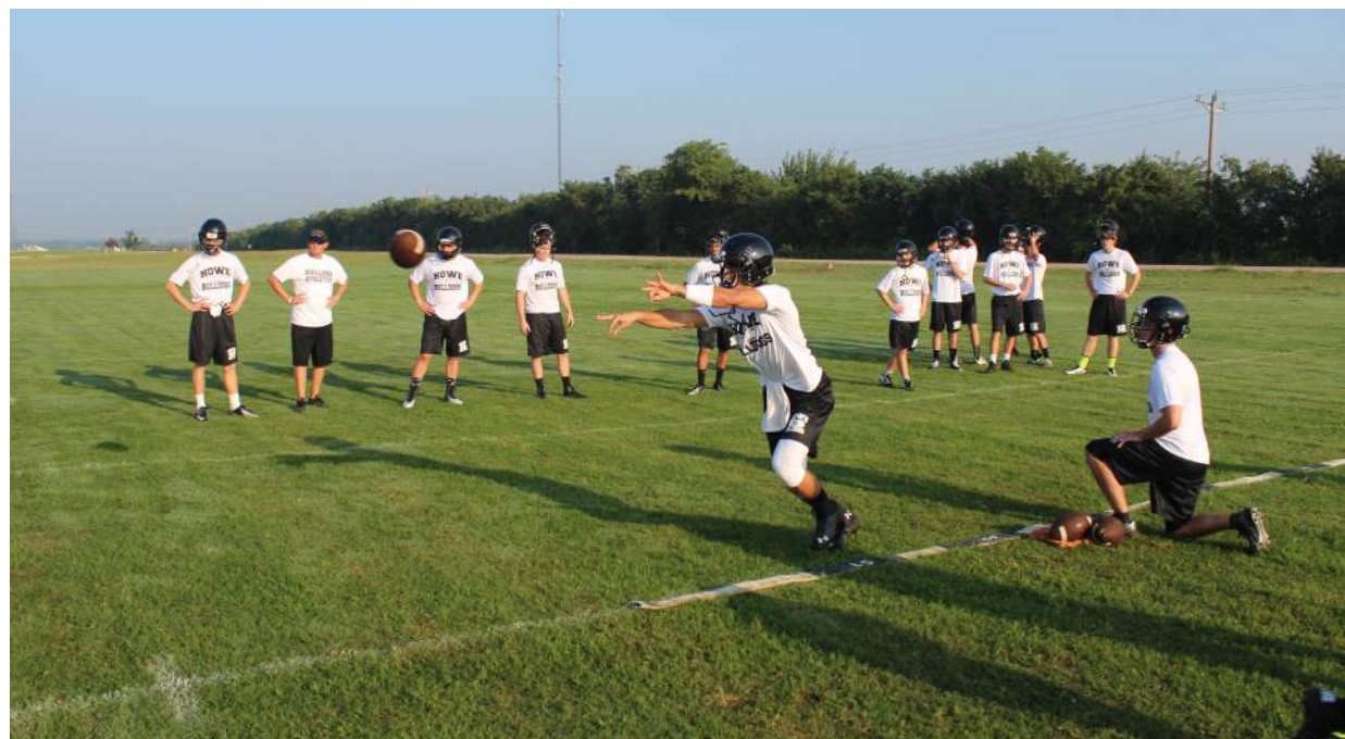
Bulldogs work on the art of the slot-T offense on Monday