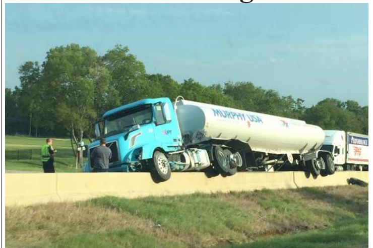
A Murphy gas slammed up and over the US 75 barrier.

Gas is always considered too high to most consumers, but in this case, it was dangerously off the charts. A semi-truck carrying gasoline for Wal-Mart high-centered Friday morning around 8:02 a.m. The driver was a 48 year-old man from Sherman and was not injured in the accident. There was only damage to the truck and concrete barrier and no other vehicles were