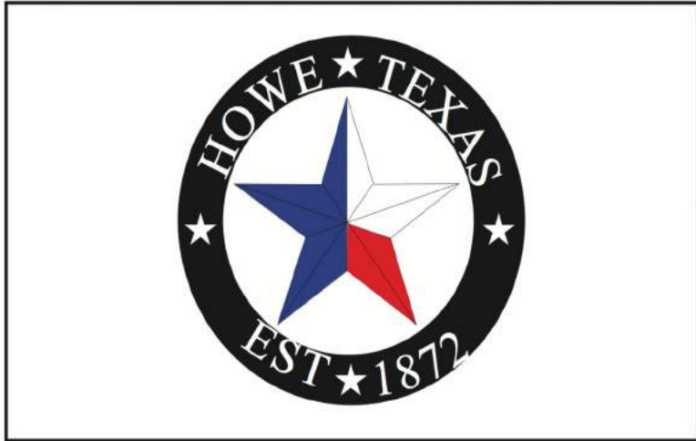
The New Howe Flag