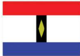
Former Howe Flag

Keep Howe Beautiful made their second presentation to the city council last Tuesday night to completely overhaul the look of the city flag. The first attempt was tabled in February until bids could be made to produce the flags. After determining that the flag had to be two-sided instead of one, the council agreed to move forward to approve the changing of the flag. The winning bid came from Lone Star Banners and Flags out of Fort Worth.